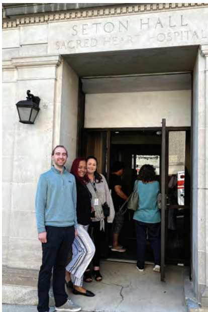
Catholic Charities staff awaits a tour of their new office building.

The Seton Hall building also was the site of the former dormitory for students in the Sacred Heart Hospital nursing school, many years ago.