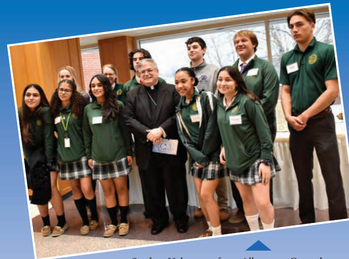
Student Volunteers from Allentown Central Catholic High School pose with Bishop Schlert.